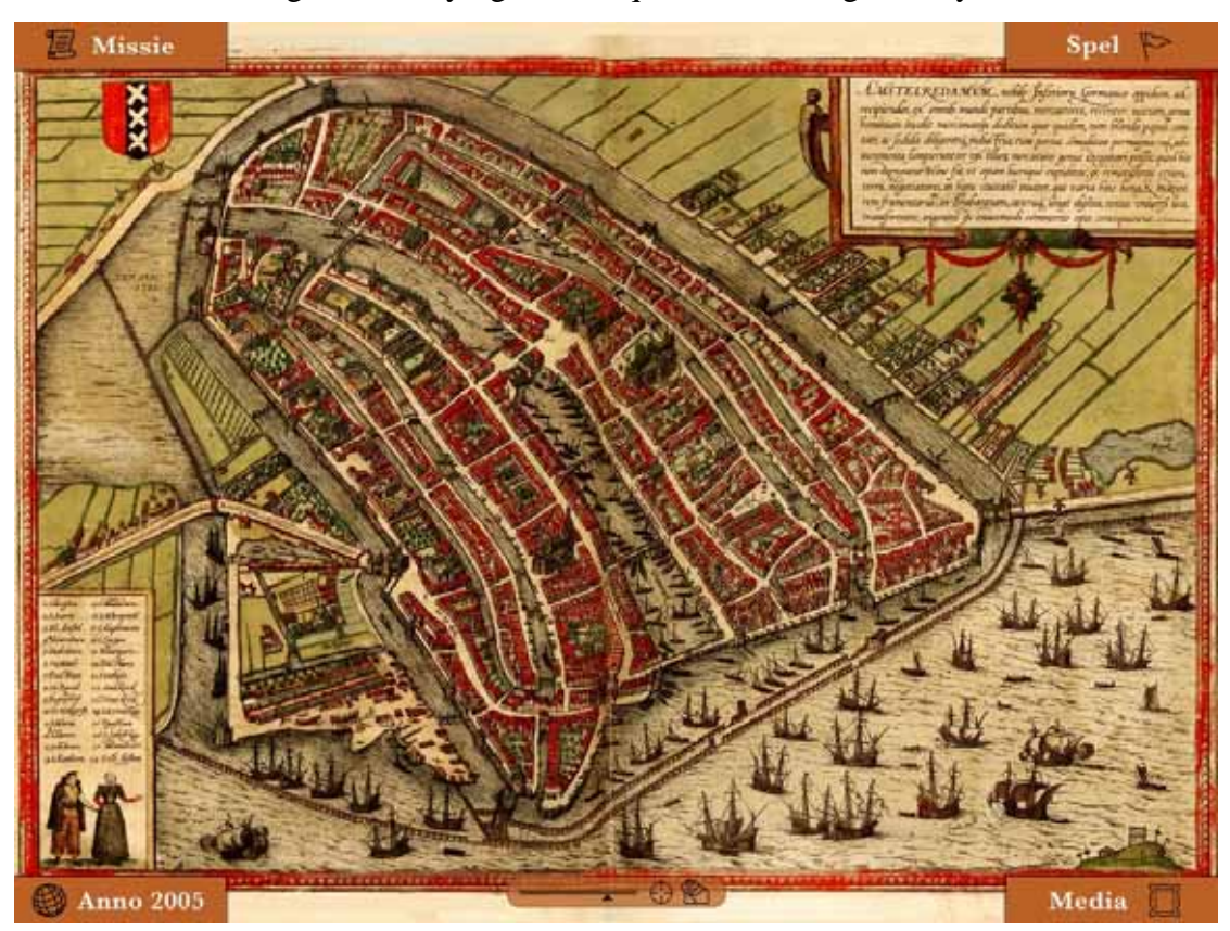
Figure 3. Map of medieval Amsterdam