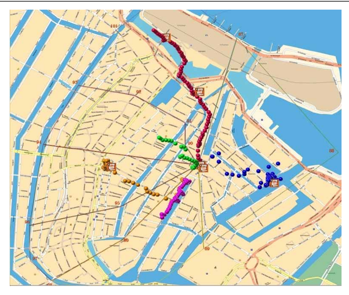
Figure 4. Contemporary map of Amsterdam

Goal of the Game. "You are a member of a pilgrim's order that comes to town to see the Host of the Miracle and to found its own monastery in Amsterdam. But first of all, you have to deserve the right to built a monastery by becoming a burgher (citizen)," according to the game's manual. A team can earn burghership or citizenship by collecting as many of the required 366 so-called "Days of Burghership" as possible. According to Aske Hopman: "These 366 points refer to the medieval year-and-a-day rule, which is the period you had to be living inside the city walls to earn citizenship rights." The team which manages to acquire burghership first earns the right to keep the Holy Host in its monastery and wins the game. Each team of pilgrims gets assigned a certain starting sector of the city it needs to explore, map, and master in a multimedial way. As the team moves around in the streets of (medieval) Amsterdam, it receives pre-recorded video clips with characters from the Middle Ages who provide information on historical locations and on the strange disappearance of the holy relic. Along the way, these medieval characters reveal bit by bit what happened to the relic, allowing players to piece this story together.