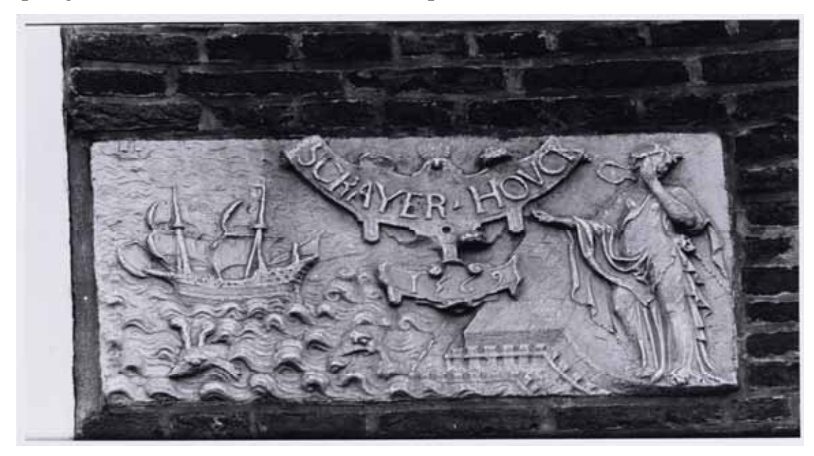
Figure 5. Tablet Schreierstoren

Although this story is frequently told and believed by many, historians agree that its authenticity is problematic. As Geert Mak writes: "it is commonly assumed that the name [Schreierstoren] means 'wailing tower,' though in fact it has nothing to do with sobbing sailors' wives waving goodbye and everything to do with the schreye , the sharp angle on which it is built" (Mak, 1999, p. 58).