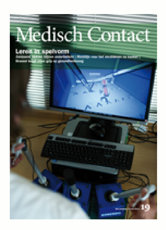
Medisch Contact 2011: 19; 1176-80